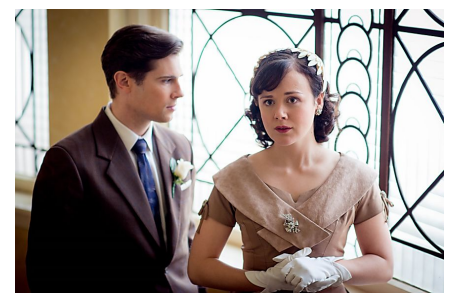
Fans of Downton Abbey May Love this Show Amazon.com