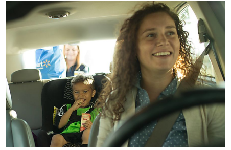
Haven't Tried Walmart's Grocery Pickup Service? Order Online, then Pickup for...