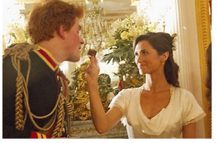
Inside Pippa Middleton's Wedding Reception: The Photos Were Not Suppose To... HealthSkillet