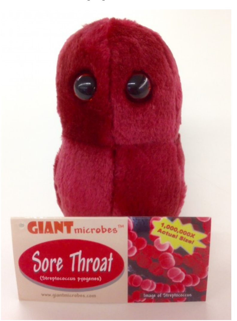
A squeezable (throttleable?) plush strep bacterium, this week's second prize.

GOD: just like a hairy black potato with wings ANGEL: um GOD: ANGEL: god? GOD: also it sleeps upside down like an idiot